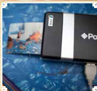
Print it out