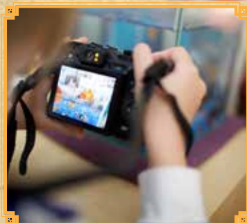
Take a photo of your creation

It really is an amazing gift to help our kid's minds focus on the good in life, and all they have been given. It is pretty much on the top of my list of things I hope to impart to my darlings!