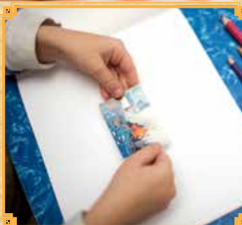
Paste it into your scrapbook