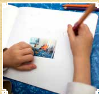
Tell the story of your project